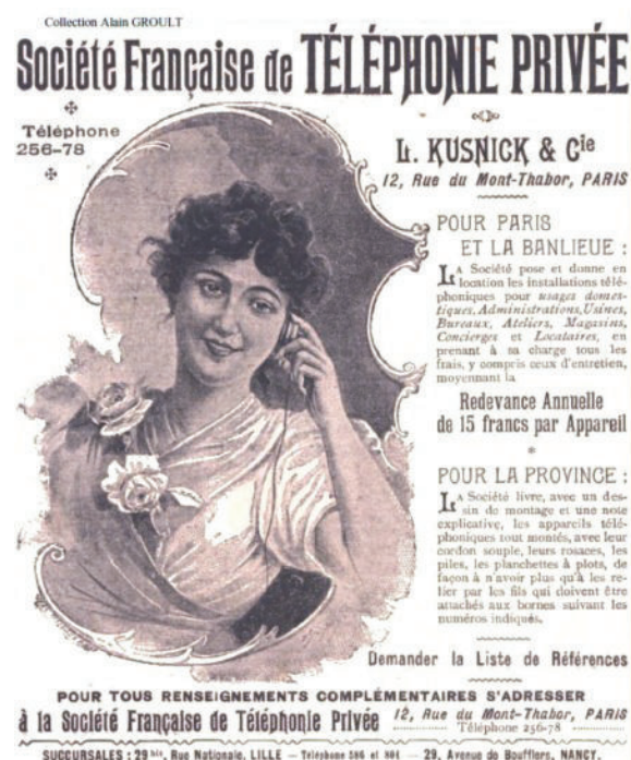
Fig 5: French Catalogue