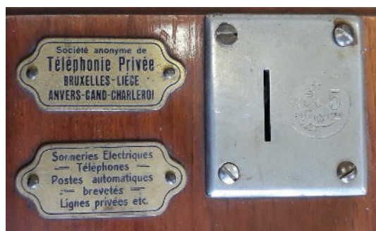
Fig 3: Distributor's label