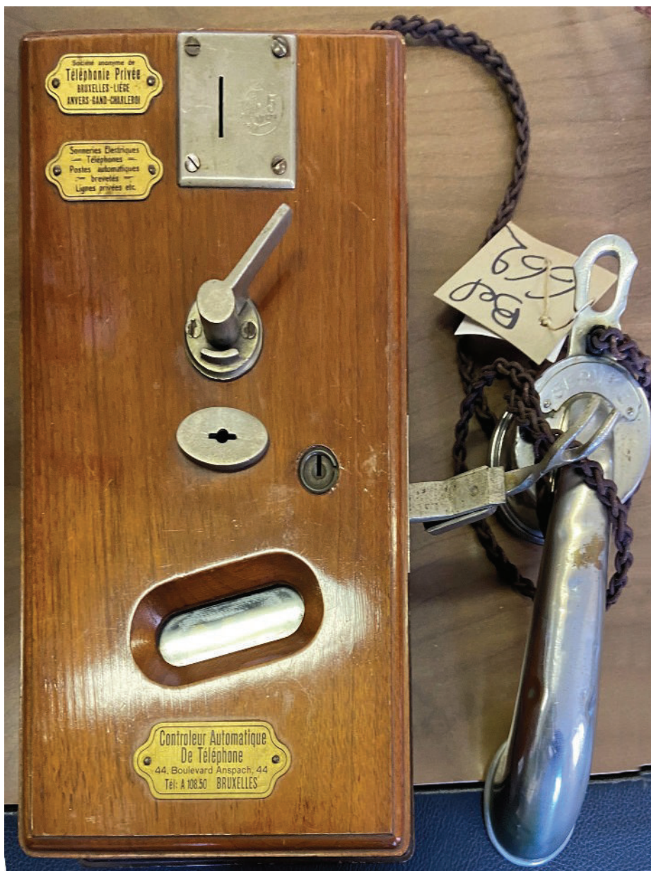
Fig 1: General view of the payphone