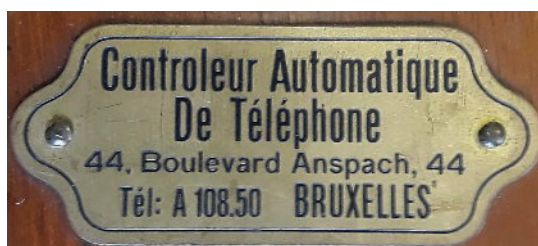
Fig 2: Manufacturer's label